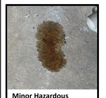
Material Overflow The responsible party shall immediately stop the source of the spill, contain spilled material, and block nearby storm drains. The incident should then be reported to the Fire Department and JAA. Create a written record of the